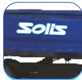
CORRUGATED SHEET FOR BETTER STRENGTH