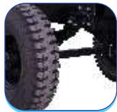
HEAVY DUTY AXLE FOR ROBUST FIELD OPERATIONS