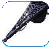
EASY TO ATTACH AND DETACH WITH TRACTOR