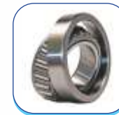
TAPER ROLLER BEARING USED FOR LONG DURABILITY