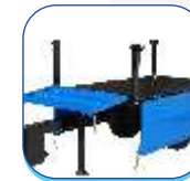
OPTIONAL ALL 4 SIDES OPENABLE