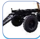
OPTIONAL HYDRAULIC TRAILER BREAK